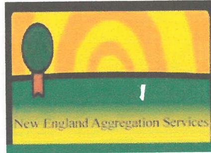
2016 New England Aggregation Services